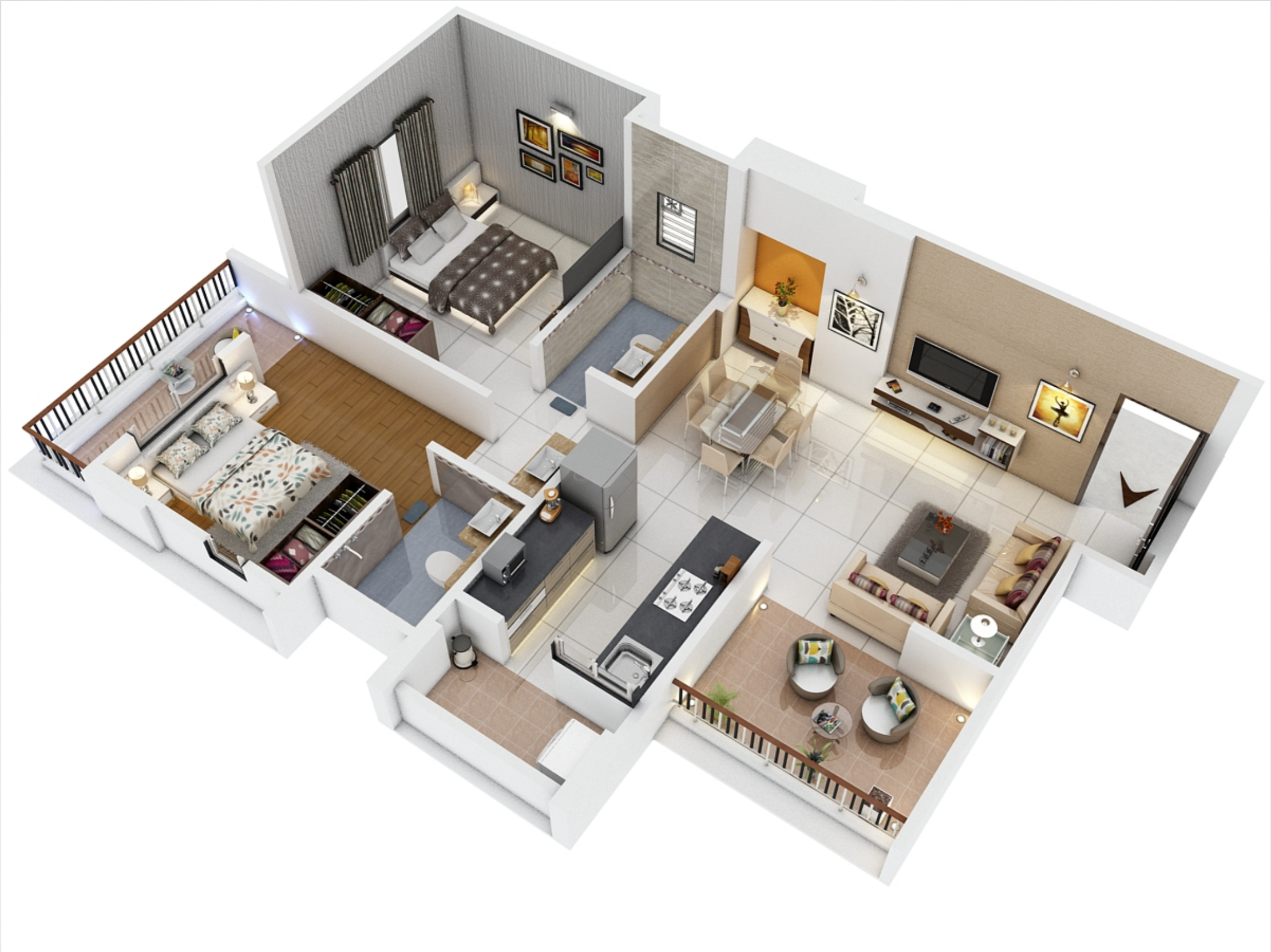
2 BHK Layout