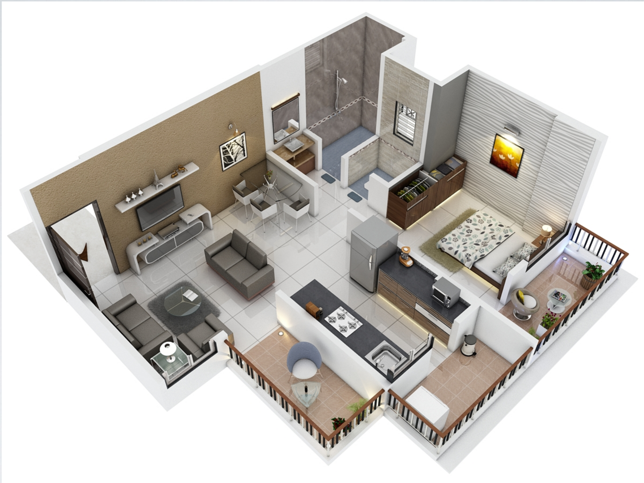
1 BHK Layout